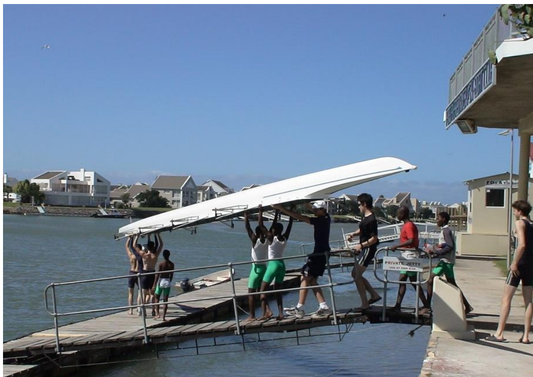
Members of ECBC with members of Nemato RC during our tour of South Africa in 2008. It is pretty easy to see that nutrition is a major issue in the township

Nemato Rowing Club is in South Africa (Nemato is short for Nelson Mandela Township) in the town of Port Alfred. Some of the schools present today have visited the club or have close links with it (notably Radley and Eton). It is about a good deal more than sport. Through such things as homework clubs, the discipline of being involved in a sport such as rowing, and even something as basic as decent nutrition, it is a real benefit to the community and allows those with few opportunities a real chance to better themselves. The club has won a number of awards in South Africa and is a wonderful example of what sport can offer a community.